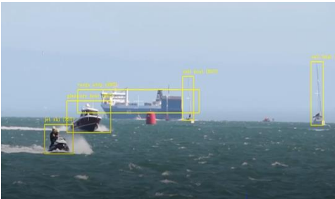
Tracking and classifying boats at sea

The Vision4ce CHARM-100NX is a standalone video processing board for embedded video and image processing applications, which is designed to host the GRIP View software. The software includes the field proven DART video tracking software. The CHARM-100NX is based on a NVIDIA Xavier embedded processor which incorporates a multicore ARM processor and powerful GPU. Video interfaces are provided for 6G, 3G, HD and SD video in digital formats.