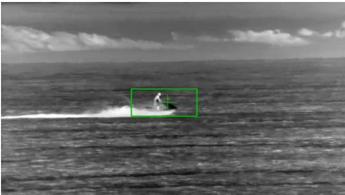
Tracking a jet-ski using IR video

The Vision4ce CHARM-100 is a standalone video processing board for embedded video and image processing applications which is designed to host the Vision4ce VMS software. The VMS software includes the field proven DART video tracking software. The CHARM-100 is based on a NVIDIA Jetson embedded processor which incorporates a multi-core ARM processor and powerful GPU. Video interfaces are provided for HD and SD video in both analog and digital formats.