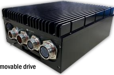
GRIP Epsilon with removable drive